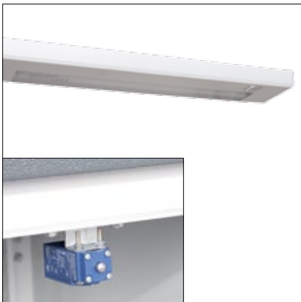
Interior lamp with door switch