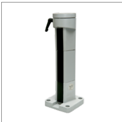
Execution 1: GTK electronic