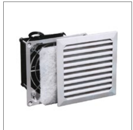
Filter fan / outlet filter