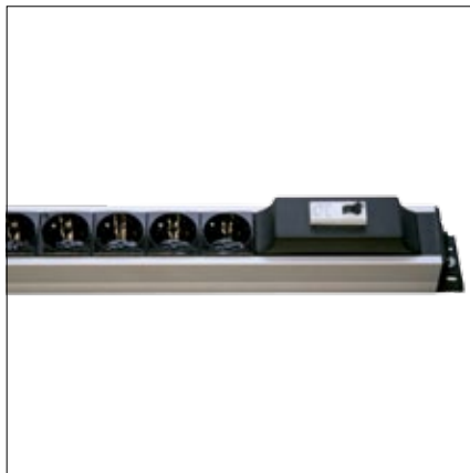
Multiple socket outlet