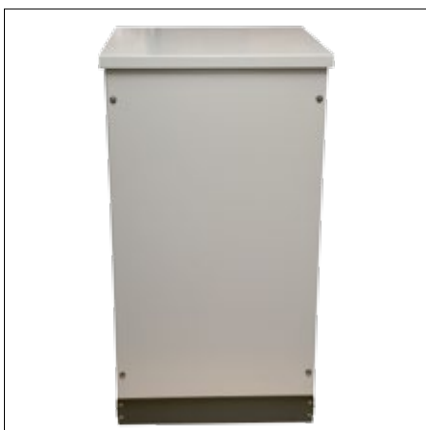
Front door, rear wall screwed