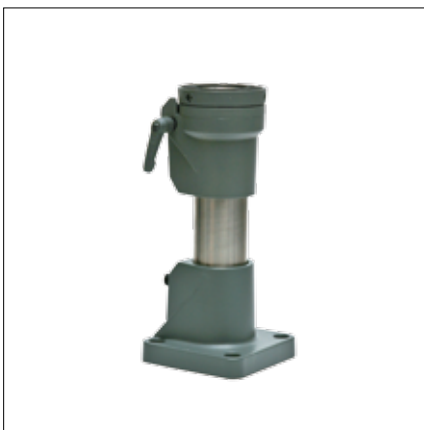
Execution 2: GT 48/2