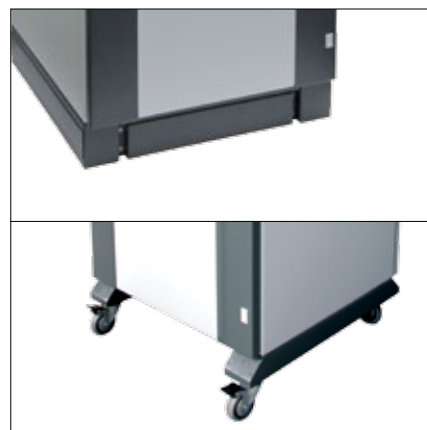
Base: Plinth, 100 mm height 4 steerable rolls