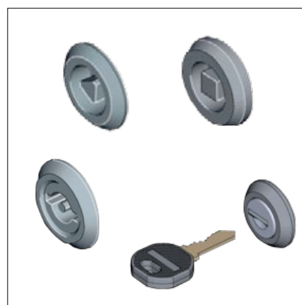
Locking systems: Triangular Square Double ward Lock cylinder