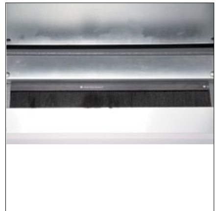
Flange plate with seal membrane