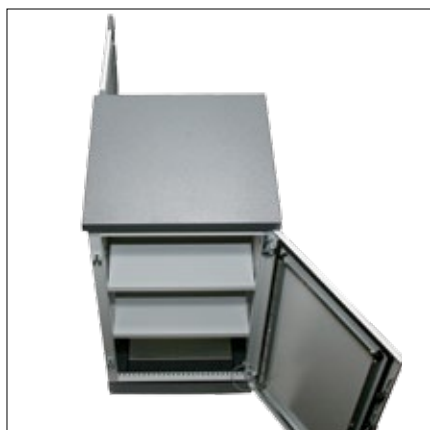
Front door, rear door