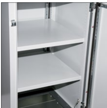
2 fix shelves