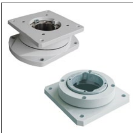
Execution 4: GTN II - Foot stand