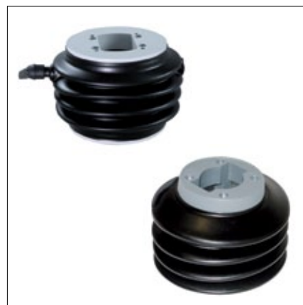
Execution 6: Inclining adapter