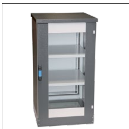
Front door with window, rear door