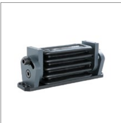
Execution 5: Moterm - Inclining adapter