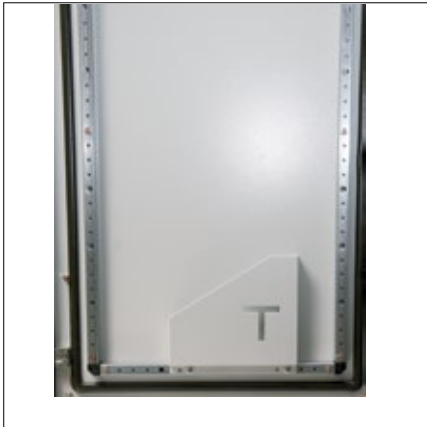
Connection diagramm pocket A4 mounted on door