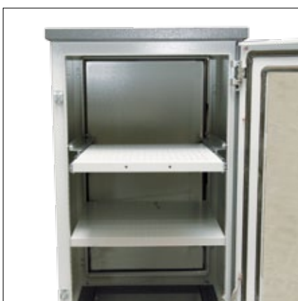
Front door with window, rear wall screwed