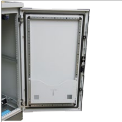
Connection diagramm pocket A3 mounted on door