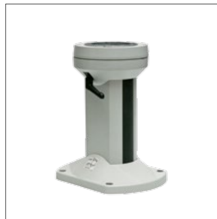
Execution 2: GTN II