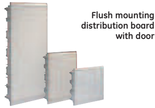
Flush mounting distribution board with door