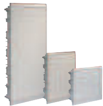
Hollow wall mounting distribution board with door