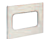
Metal door with clear window for surface mounting distribution boards